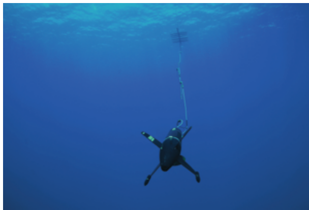
Massive Towing Capability — Tow cable assembly attached to Wave Glider sub