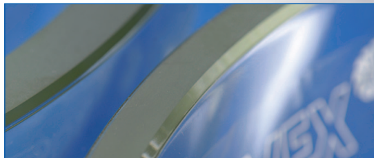
P/N 790257: VITROVEX Hemisphere OD 432 mm, WS 14 mm P/N 790278: VITROVEX Hemisphere OD 432 mm, WS 18 mm P/N 790233: VITROVEX Hemisphere OD 432 mm, WS 21 mm

A VITROVEX® 17" glass spheres consists of two mated glass hemispheres that are evacuated and locked into position by a sealant and protective tape.