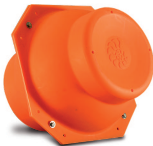
Smooth protective shell, P/N 790250