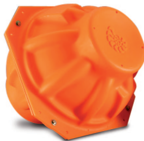
Ribbed protective shell, P/N 790251