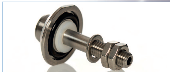
P/N 790260, P/N 790262L: Vacuum port

For each instrument sphere a fully assembled vacuum port within a respective drill hole and flat ground is part of the standard package.